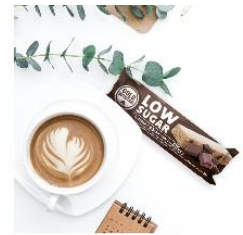
LOW SUGAR 30 G