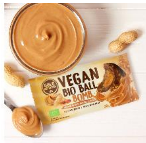
VEGAN BIO BALL BOMB